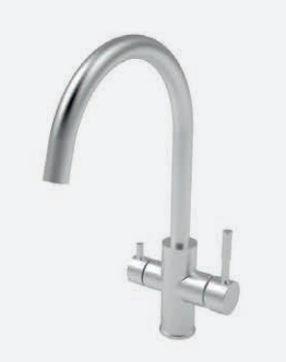
STAINLESS STEEL GOOSE NECK THREE-WAY TAP